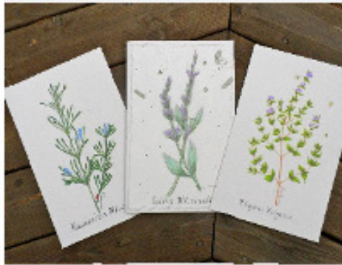
Herbal Cards* Prismacolor pencils Pressed paper and paper cards Joni Keskey *$15 w/o pencils, $38 including pencils