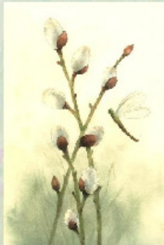
Pussy Willows & the Dragonfly — $15 9 X 14, Watercolor, double mat included Louise Hastings