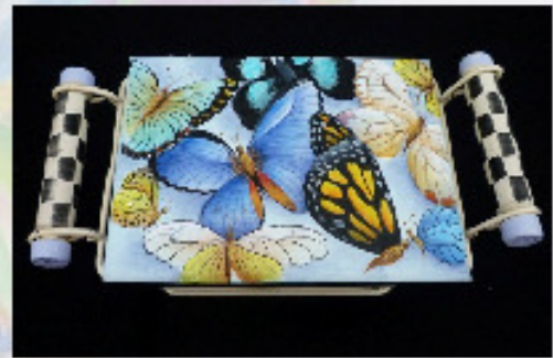
Butterfly Basket — $16 4 x 6, Acrylics on wooden basket lid Lynne Deptula