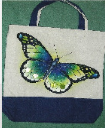
Glimmer Flight—$22 So-Soft fabric paint with glimmer and bead enhancement 14 x 16 canvas tote bag Jeanne Collick