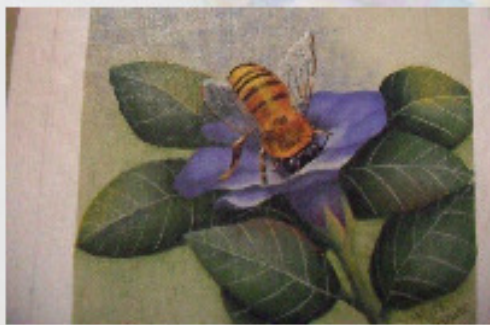
Bee and Vinca Flower—$20 8 1/2 x 8 1/2, Acrylics on wooden basket lid Karen Rowan