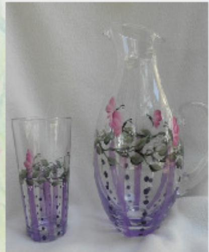
Butterflies and Flowers — $20 Enamels on Glass Pitcher & 2 Glasses Bonnie Phebus