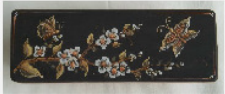
Chinoiserie Butterflies & Buds—$27* 9 x 3 x 2 1/2, on wooden basket lid Gold and silver powders with acrylic varnish Judy Diephouse *includes sets of powders